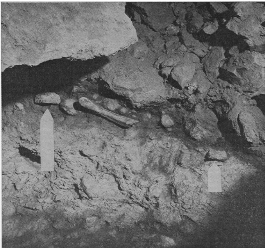
Fig. 2. Large arrow points to a chopper to the left of the rib in Zone H. Small arrow points to a side scraper at the right in the same stratum.

The dating of the remains of man with the extinct fauna also involved special problems. Portions of the Megatheriidae humerus from Zone H in direct association with the tools (Figs. 1 and 2) were cleaned with a wire brush and distilled water to remove any gross extraneous material. A small sample from the interior of the specimen was analyzed for its fluorine (0.86 percent) and nitrogen (0.71 percent) content. Then the collagen fraction of the bone was isolated according to a procedure (1) which destroys the mineral matrix in dilute hydrochloric acid and leaves the bulk of the protein intact. This method was chosen over another which produces individual amino acids and ignores contaminants such as tar found, for example, in bones stemming from Rancho La Brea, California (9). The reason for this choice was the probable absence of major contamination in the Pikimachay bone since it was found in the protective environment of a cave. Nevertheless, collagen isolated by the first procedure